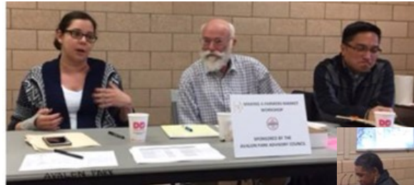
Avalon Park, 1215 E. 83rd St., Chicago, IL 60619. Submitted by the Avalon Park Advisory Council.

Prior to forming the Avalon Park Advisory Council (APAC), many residents were complaining about the lack of resources at Avalon Park. Many of our residents go to other parks outside of our district for their programs. APAC is one year old, and one of our main goals is to bring more activities to the park that the residents want. Our mission is to be advocates for Avalon Park and for the residents who utilize its programs, facilities, resources, and natural areas. In our first year, we have had our share of accomplishments, but faced many challenges as well.